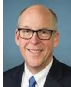
U.S. Congressman Greg Walden Running for Re-Election