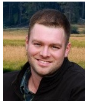
Dallas Heard State Rep. District 2 Running for Re-Election